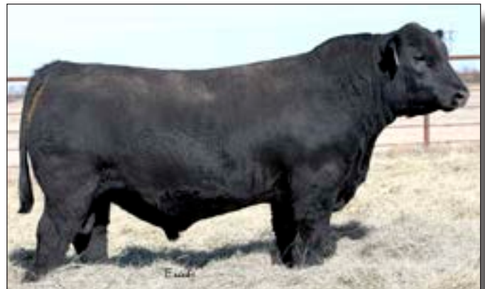
KLA PRESIDENT 9112 - Lot 10

The Pathfinder Dam has a progeny birth ratio of 99 and a progeny weaning ratio of 104 on five natural calves along with progeny IMF and ribeye ratios of 105 on nine head.