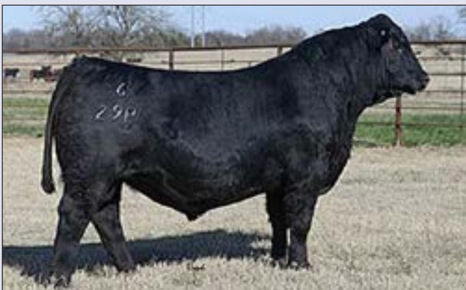
CONNELY COPYRIGHT - Reference Sire J.

This featured bull is a member of the first calf crop by the Albrecht/Penz sire Connealy Copyright. This bull has an individual birth ratio of 96 combined with individual weaning and yearling ratios of 104 and 100, respectively along with an individual ribeye ratio of 107 as the first calf from a dam by SAV Forefather 3024, backed by the Emblynette family. The grandam is a maternal sister to the $20,000 second top-selling bull of the 2017 President's Day sale.