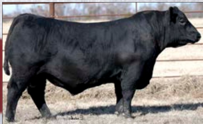
KLA PRESIDENT 9119 - Lot 1

12 noon at the Clay Freeny Ranch • Caddo, Oklahoma