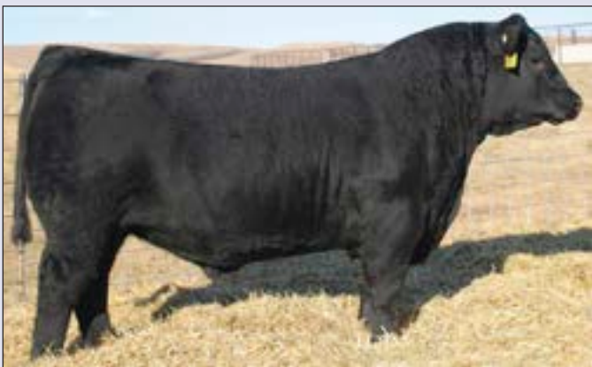
SAV CALIBER 6131 - Reference Sire I.

Featuring the first progeny by this Albrecht/Penz herd sire who was selected as a favorite of the 2017 SAV Sale. This son of the Select Sires Pathfinder Sire Connealy Capitalist 028 was produced from a second-generation Pathfinder Dam who serves as an SAV donor and is backed by the Pathfinder Sires SAV Resource 1441 and SAV Bismarck 5682.