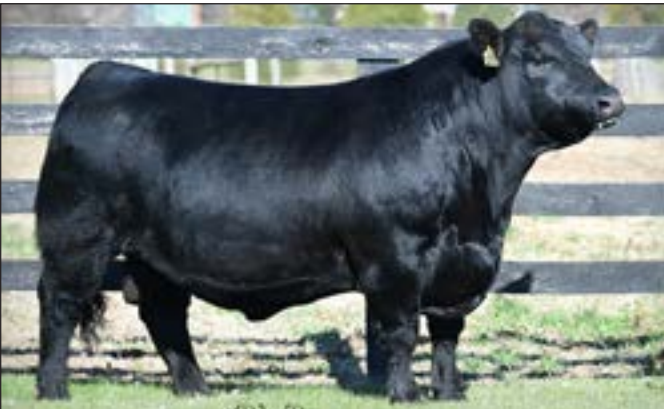
SAV AMERICA 8018 - Paternal brother to Lots 1 through 18.

This bull records individual weaning and yearling ratios of 120 and 113, respectively along with individual IMF and ribeye ratios of 107 and 104, respectively from a dam with a progeny weaning ratio of 107 on eight calves and a progeny yearling ratio of 107 on seven head along with progeny IMF and ribeye ratios of 105 and 102, respectively on eight head. A maternal brother was the $10,500 third top-selling bull of the 2014 President's Day Sale.