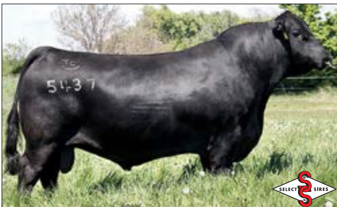
TEX PLAYBOOK 5437 - Sire of Lot 156.

A special highlight herd sire prospect with an individual birth ratio of 97 balanced with individual weaning and yearling ratios of 119 and 113, respectively along with an individual ribeye ratio of 107. This son of the widely used Select Sires bull Tex Playbook 5437 was produced from a dam by the Alta Genetics Pathfinder Sire Connealy Contractor.