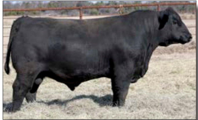
KLA CALIBER 937 - Lot 67

A moderate birth weight high-maternal prospect from the first calf crop by SAV Caliber 6131. This bull was produced as the first calf from a two-year-old dam by Connealy Western Cut.