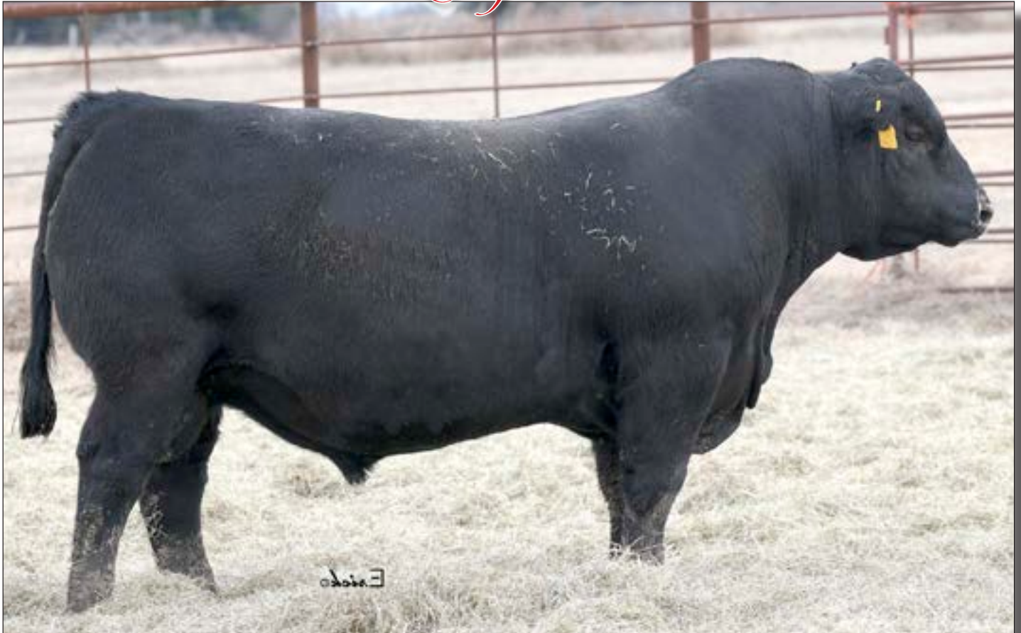
PENZ RESEED 8519 - Lot 32