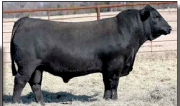
KLA RICKY BOBBY 915 - Lot 33

This flush brother to Lot 32 is from the successful blending of the Genex Pathfinder Sire SAV Resource 1441 with the highly proven and productive SAV Emblynette 7566. His $85,000 maternal sister, SAV Emblynette 0491, produced the $100,000 Genex sire SAV West River 2066 and the $20,000 Genex sire SAV Catalyst 6704. His Pathfinder maternal sister SAV Emblynette 2369 produced the $175,000 SAV Emblem 8074, the $75,000 SAV Ajax 8885, the $27,500 ST Genetics sire SAV Dewdrop 8119 and the exciting SAV Bloodline 9578.