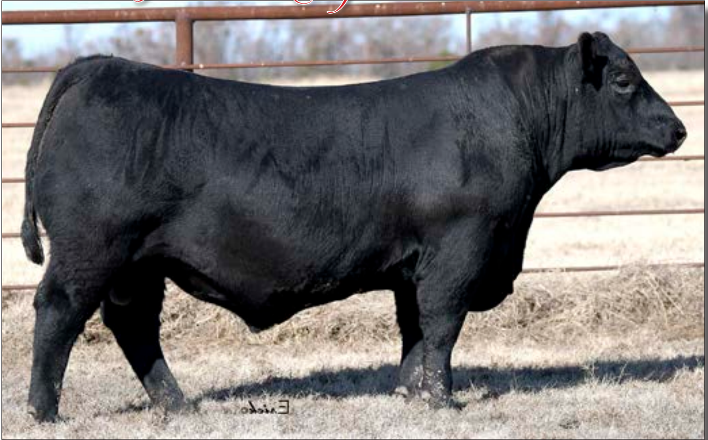
KLA PRESIDENT 9119 - Lot 1