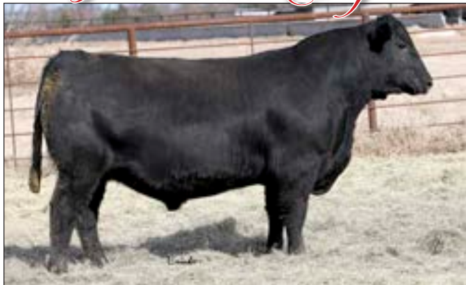
PENZ SUPER HERO 8629 - Lot 122