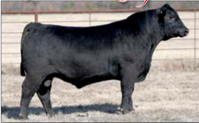
PENZ IRON ORE 8577 - Lot 75