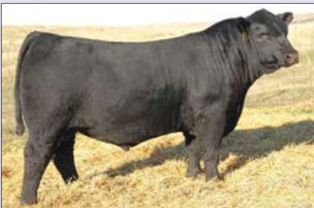
SAV FOREFATHER 3024 - Reference Sire S.

The Albrecht/Penz featured sire selected as the heaviest weaning natural calf of the 2014 SAV Sale and the $40,000 top-selling lead-off bull of his sire group. This proven calving-ease sire by the $80,000 SAV Birthstone 8258 is a maternal brother to the $70,000 Select Sires bull SAV Ancestry 6090. The son was the $38,000 top-selling bull of the 2017 President's Day Sale.