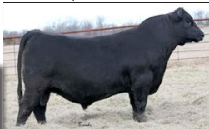
PENZ HOT ROD 8537 - Lot 48

This impressive flush brother to Lots 42 through 47 has individual IMF and ribeye ratios of 102 and 122, respectively. The famous donor dam is the all-time top income-producing daughter of SAV Net Worth 4200 with more than 100 progeny that have sold through SAV Sales in addition to 22 daughters retained in the SAV herd and highlights of both the 2019 and 2020 President's Day Sales.