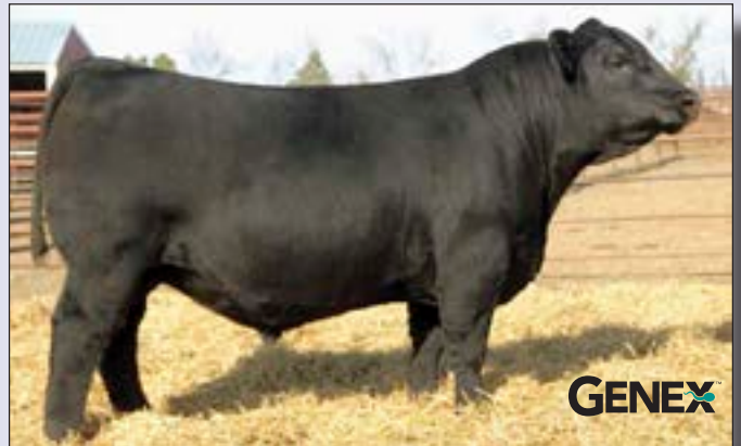
SAV REGARD 4863 - Reference Sire E.

The $180,000 top-selling bull of his sire group in the 2015 SAV Sale who transmits incredible muscle, performance and quality. This now deceased member of the Genex AI Stud ranks among the breed's most elite for growth, carcass weight and ribeye area with a linebred Blackcap May pedigree, sired by SAV Resource 1441.