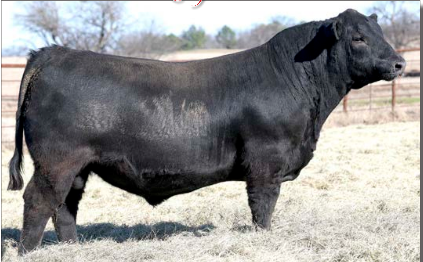
PENZ FIRST RATE 8604 - Lot 113