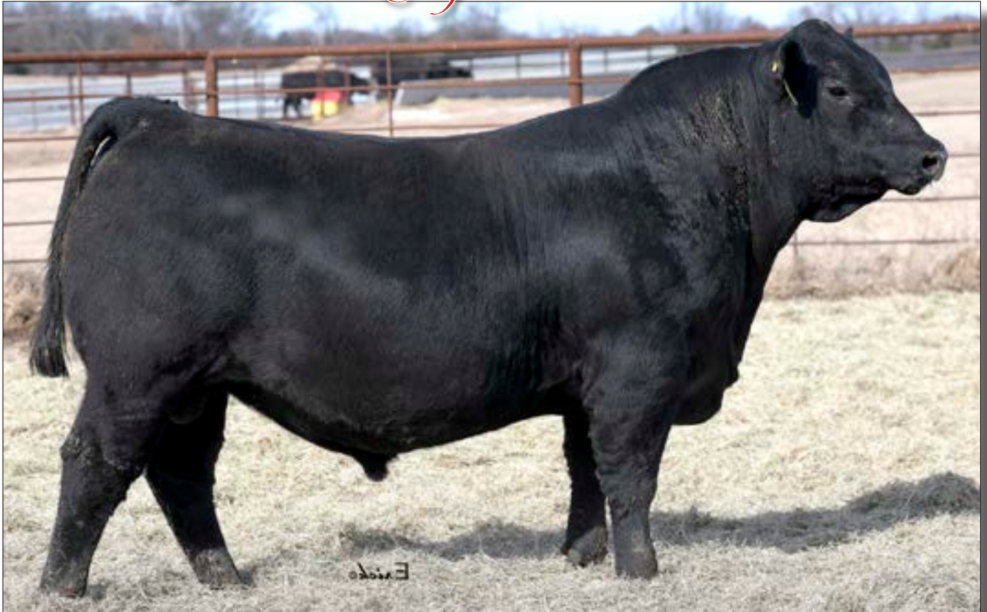
PENZ PREDECESSOR 8550 - Lot 108