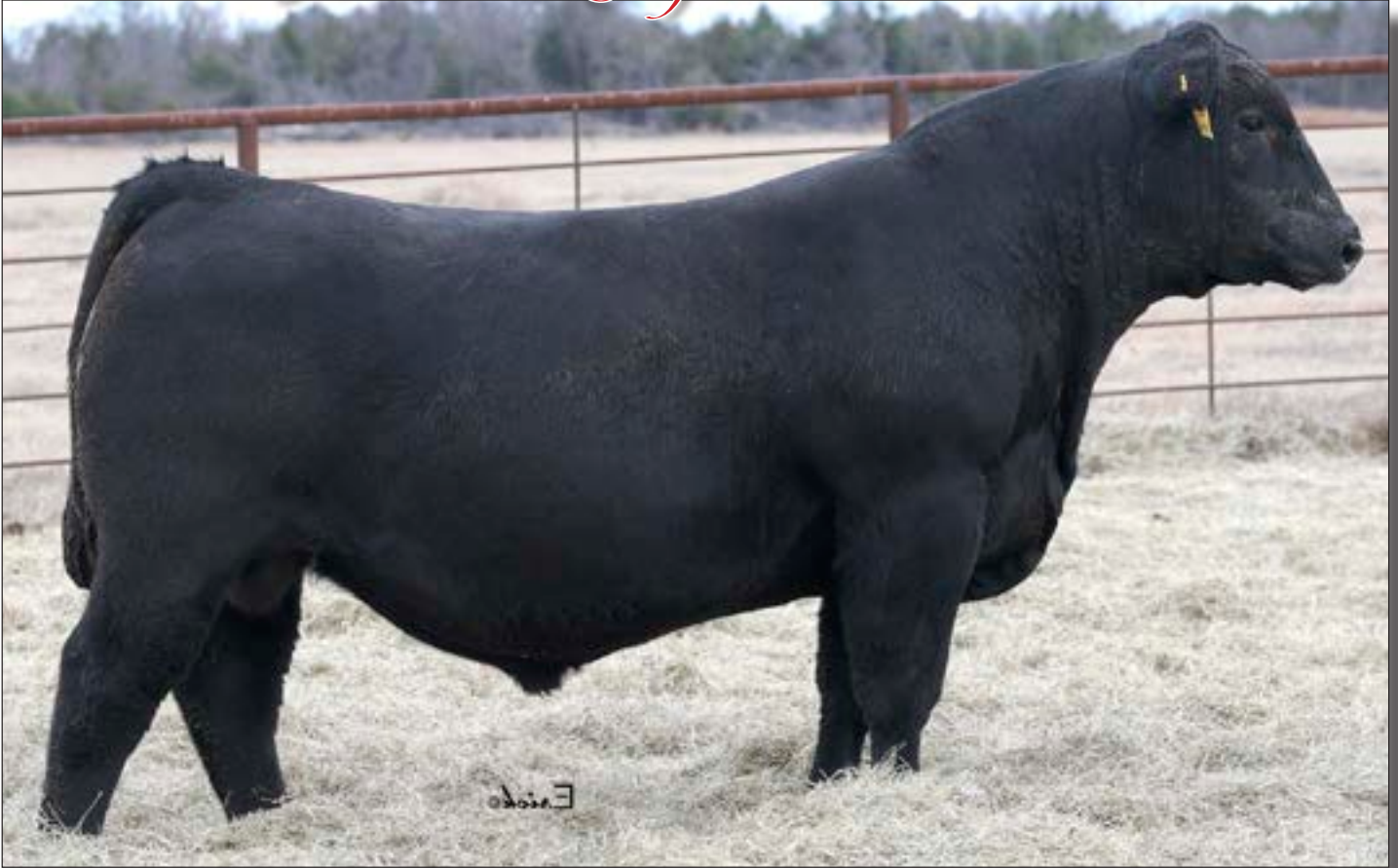
PENZ TRUMP 8549 - Lot 16