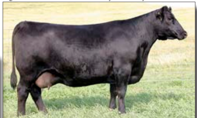
SAV EMBLYNETTE 7566 - Dam of Lots 4, 30-33, 42-48 and 165-167.

This royally-bred fall yearling bull was produced as the natural calf by the $750,000 SAV President 6847 from the Albrecht and Penz foundation donor SAV Emblynette 7566 who has generated $1.5 million in progeny sales-to-date and records progeny weaning and yearling ratios of 107 and 106, respectively on four natural calves along with progeny IMF and ribeye ratios of 108 and 101, respectively on 106 head evaluated by ultrasound. The grandam is a fourth-generation Pathfinder Dam, backed by generations of the time-tested Emblynette family.