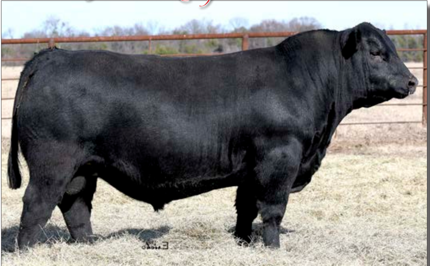
KLA PRESIDENT 9104 - Lot 8