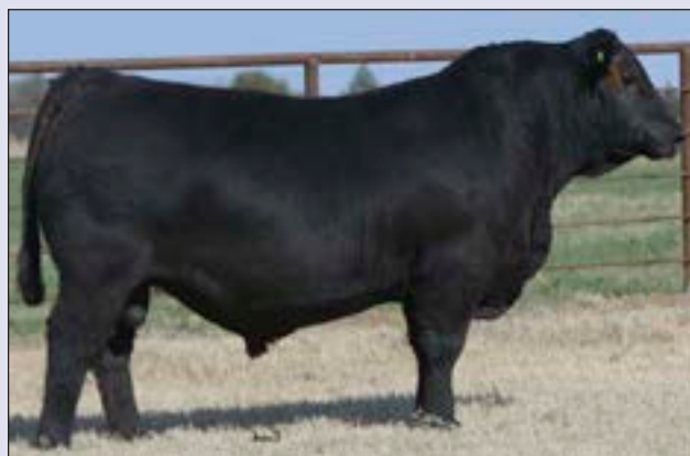
PENZ FIELD DAY 6580 - Paternal brother to Reference Sire R.

This bull was produced as the first calf from a dam by EXAR Endurance 3949B.