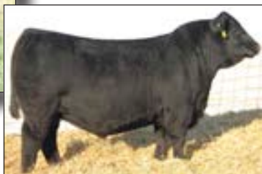
SAV REAL WORLD 4097 - This full brother to Lots 32-33 is a maternal brother to Lots 4, 30, 31, 42-48 and 165-167.