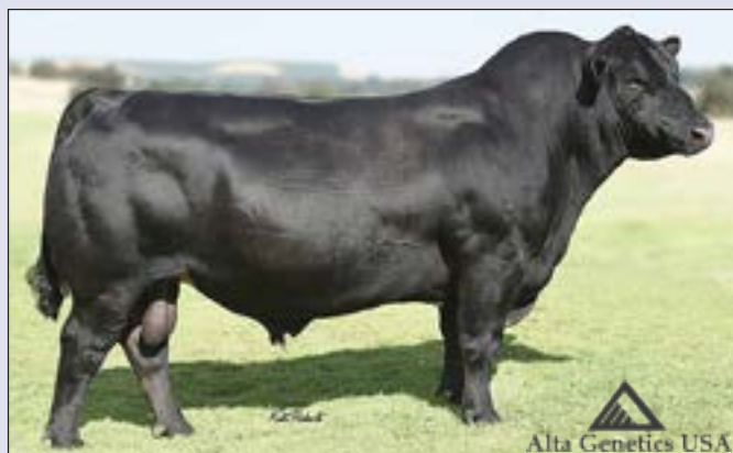
SAV TECHNIQUE 5120 - Reference Sire U.

The Albrecht/Penz sire in the Alta Genetics AI Stud selected as the $52,500 feature of the 2016 SAV Sale where he recorded a 365-day ribeye of 19.5 square inches, produced from a famous full sister to SAV Resource 1441, SAV Renown 3439 and SAV Recharge 3436. His first progeny include the Alta Genetics sire Penz Prevail who is the $31,000 top-selling bull of the 2019 President's Day Sale.