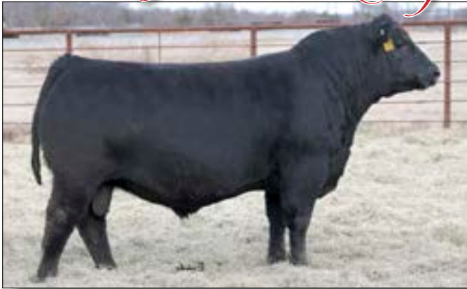
PENZ INDEPENDENCE 8703 - Lot 137