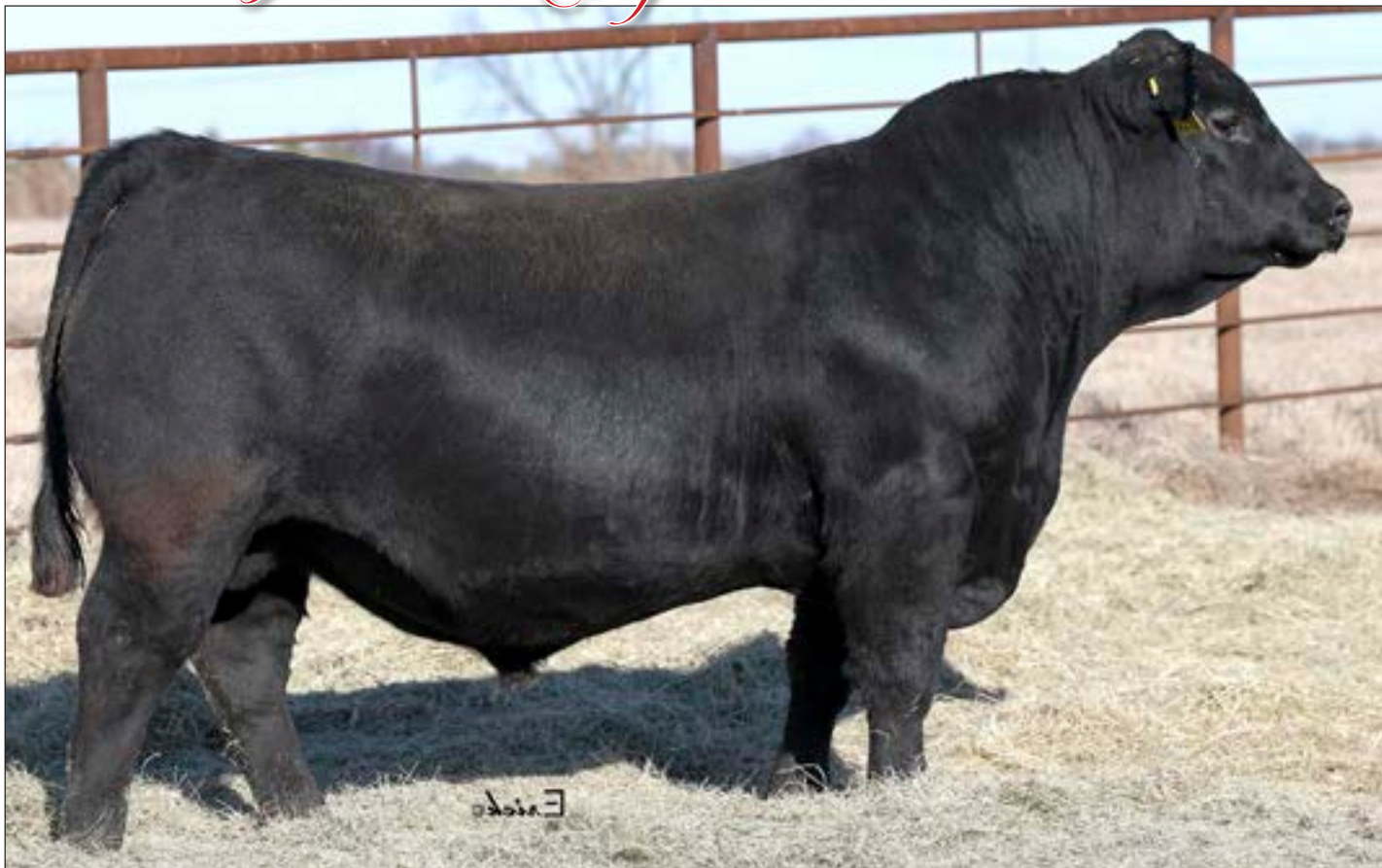
PENZ PREDECESSOR 8569 - Lot 106