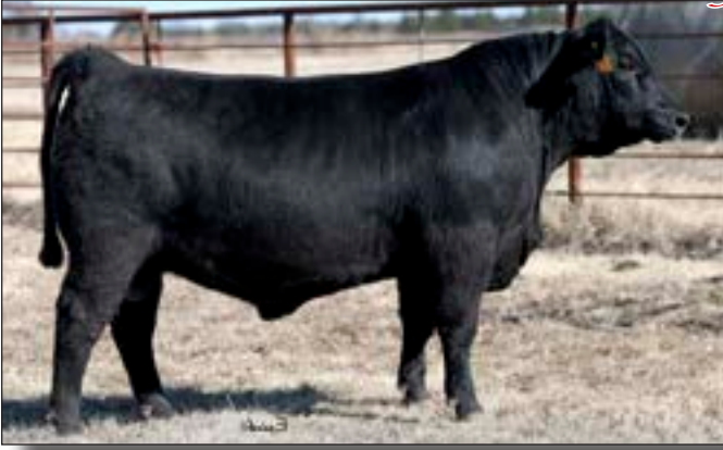
PENZ ENDURANCE 8511 - Lot 88