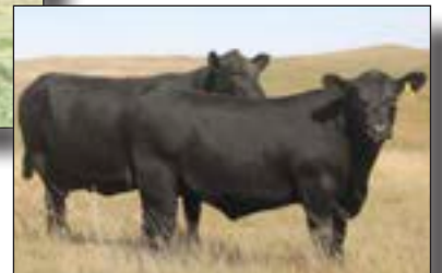
SAV EMBLYNETTE 6506 - This full sister to Lots 30-31 is a maternal sister to Lots 4, 32, 33, 42-48, 165-167.