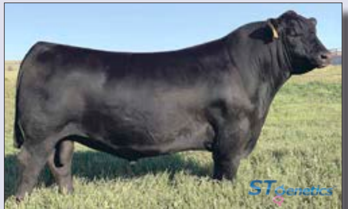
SAV RAINDANCE 6848 - Reference Sire B.

The $450,000 ST Genetics sire who is the second lead-off bull of the 2017 SAV Sale from the world record-selling flush of bulls. This son of the Pathfinder Sire Coleman Charlo 0256 is from SAV Blackcap May 4136, the all-time world record income-producing cow with more than $10 million in progeny sales.