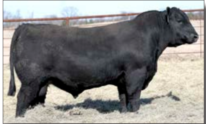
KLA RESPECT 9103 - Lot 40

This high-indexing son of SAV Regard 4863 has earned individual weaning and yearling ratios of 118 and 114, respectively along with an individual ribeye ratio of 104. His Pathfinder Dam records an individual weaning ratio of 108 on six calves with two daughters in production who post a collective progeny weaning ratio of 105.