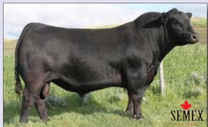
KR CASH FLOW - Reference Sire Q.