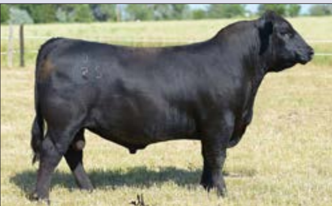
BALDRIDGE COLONEL C251 - Reference Sire F.

This bull records an individual IMF ratio of 134.