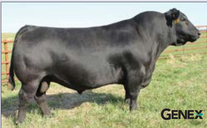
SAV RESOURCE 1441 - Reference Sire D.

This flush brother to Lot 36 is sired by SAV Resource 1441 produced from a maternal sister to the second top-selling bull of the 2019 President's Day Sale and third top-selling bull of the 2017 President's Day Sale. Seven maternal sisters post a collective progeny weaning ratio of 101.