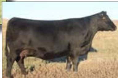
SAV EMBLYNETTE 2369 - Maternal sister to Lots 4, 30-33, 42-48, 166 and 167 is a full sister to Lot 165.