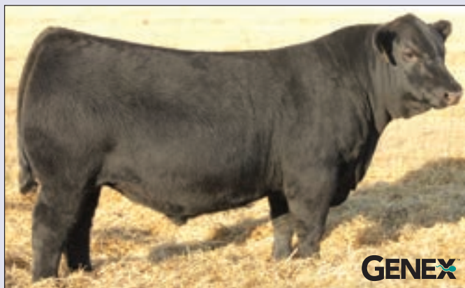
SAV INSTINCT 4258 - Reference Sire W.

This proven performance son of SAV International 2020 is from a top-producing dam with a progeny weaning ratio of 107 on five calves, stemming from the second generation Pathfinder Dam SAV Emblynette 1181.