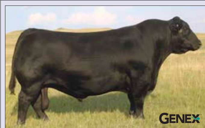
SAV RENOWN 3439 - Reference Sire C.

This son of SAV Renown 3439 has individual weaning and yearling ratios of 106 along with an individual ribeye ratio of 106 from a proven dam with a progeny weaning ratio of 107 on five calves, stemming from two-generations of Pathfinder Dams. A full brother to the dam of this bull is the $12,000 sixth top-seller of the 2015 President's Day Sale.