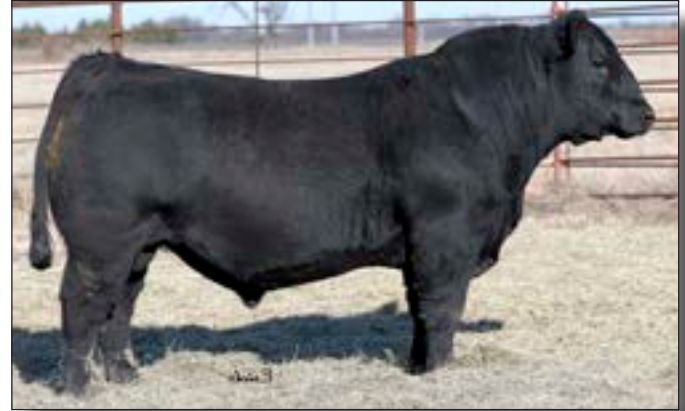
KLA CASH BACK 923 - Lot 104

The dam is a maternal sister to the $13,500 fifth top-selling bull of the 2018 President's Day Sale.