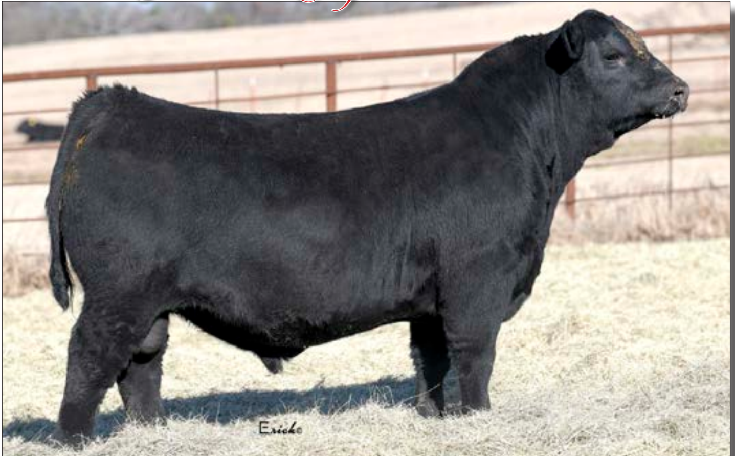
PENZ OMG 8722 - Lot 111