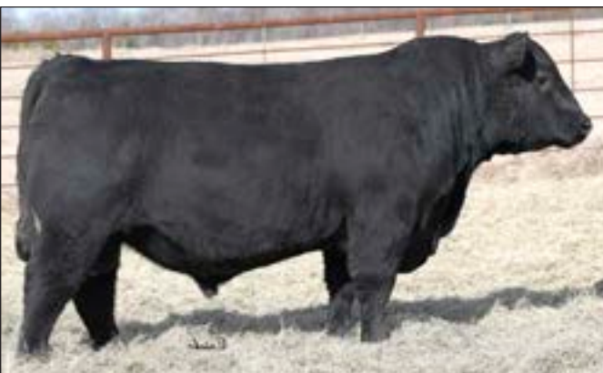
KLA VICE PRESIDENT 9121 - Lot 6

This bull combines an individual yearling ratio of 103 with individual IMF and ribeye ratios of 110 and 101, respectively.