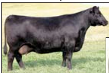
SAV EMBLYNETTE 7566 - Dam of Lots 4, 30-33, 42-48, and 165-167.

Maternal brothers include an impressive array of SAV Sale features as well as several of the featured and top-selling bulls of the 2019 President's Day Sale.