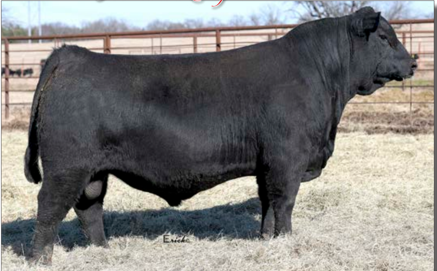
PENZ CAPTAIN 8513 - Lot 62