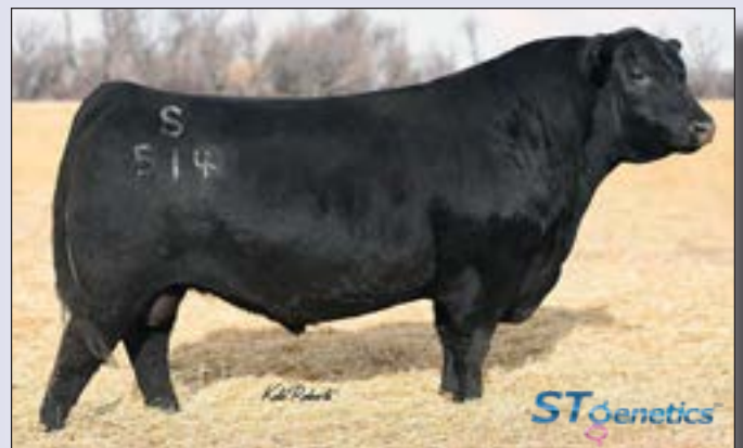
S FOUNDATION 514 - Reference Sire O.

This member of the ST Genetics AI Stud is the top-selling bull of the 2016 Spickler Spring Sale. This son of the Semex sire Vision Unanimous 1418 is from a Pathfinder Dam by the Genex sire S Chisum 6175.