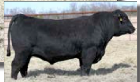
PENZ FOUNDATION 8541 - Lot 95