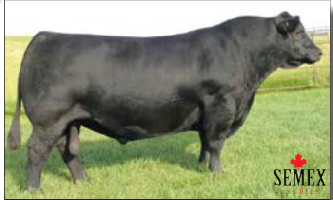
SAV HARVESTOR 0338 - Sire of Lot 154.

The grandam was selected from the McKellar program.