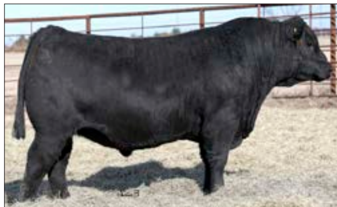
PENZ ALL BUSINESS 8579 - Lot 54

The one and only bull in the sale by the Alta Genetics Pathfinder Sire Connealy Contractor. This promising prospect has an individual birth ratio of 93 combined with individual IMF and ribeye ratios of 103 and 107, respectively.