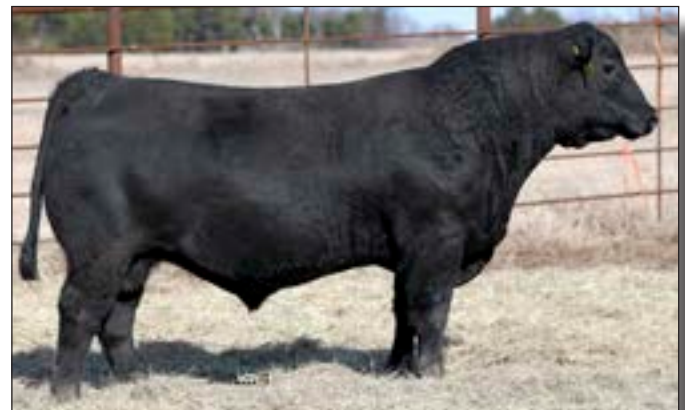
PENZ CLAIBER 8515 - Lot 61

A low birth weight calving-ease prospect backed by SAV Caliber 6131 and SAV Platinum 0010 from the time-tested Emblynette family. The dam is a maternal sister to Penz Recovery 5688, the $20,000 second top-selling bull of the 2017 President's Day Sale.