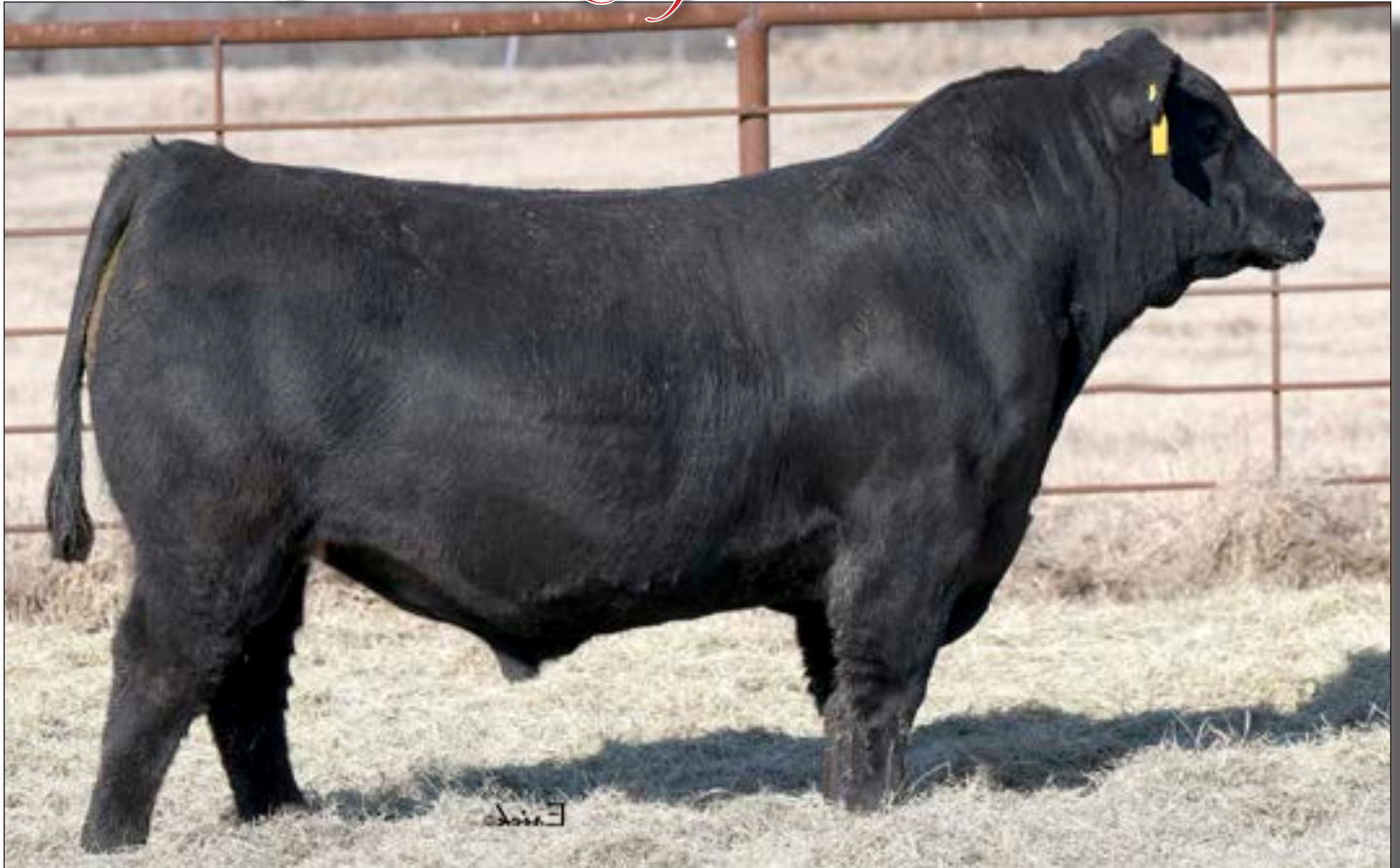
PENZ COPYRIGHT 8568 - Lot 71