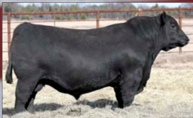
KLA READJUST 986 - Lot 26