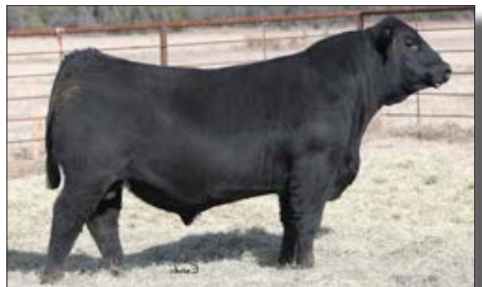
PENZ PREDICTION 8548 - Lot 110

This bull was produced as the first calf from a two-year-old dam.