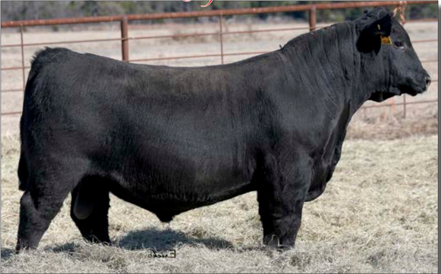
PENZ RAINMAN 8601 - Lot 22