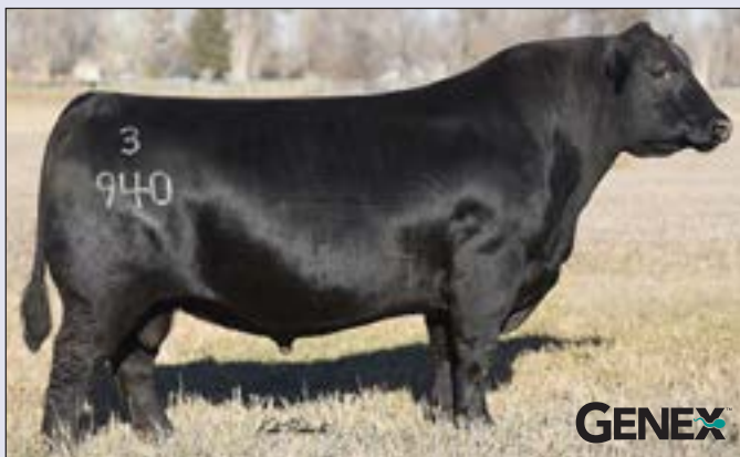
CONNELY CONFIDENCE PLUS - Reference Sire G.

The grandam is a prolific Albrecht donor with multiple sons in this sale.