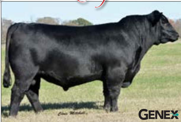
KLA LONESOME DOVE 54 - $30,000 sire of Lot 159.