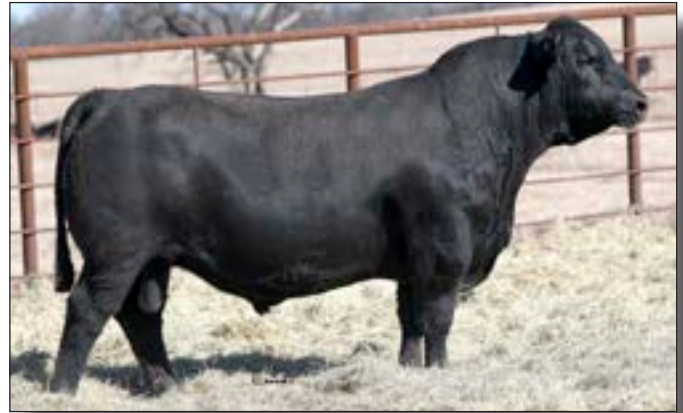
KLA PLATINUM 91 - Lot 77