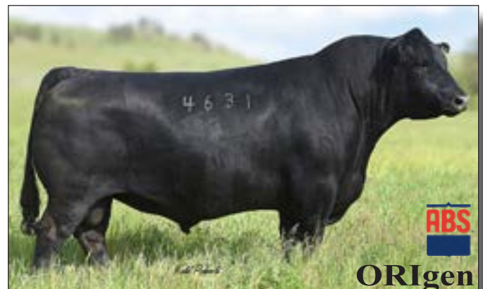
3F EPIC 4631 - Sire of Lot 157.

A maternal sister records a progeny weaning ratio of 103 on two calves.