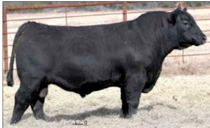
KLA TITANIC 948 - Lot 124

This son of the $650,000 SAV Sensation 5615 records an individual birth ratio of 97 combined with an individual weaning ratio of 106. This bull was produced as his dam's first calf.