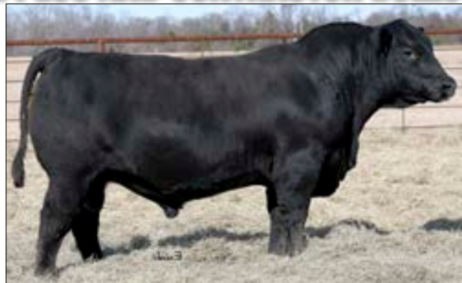
KLA CONFIDENCE PLUS 965 - Lot 53