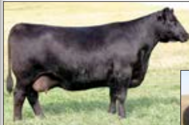
SAV EMBLYNETTE 7566 - Dam of Lots 4, 30-33, 42-48, and 165-167.

The dam has progeny weaning and yearling ratios of 107 and 106, respectively on four natural calves along with progeny IMF and ribeye ratios of 108 and 101, respectively on 106 head evaluated by ultrasound, and the grandam is a fourth consecutive generation Pathfinder Dam.