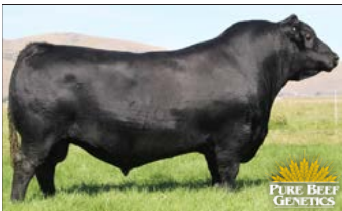
COLEMAN BRAVO 6313 - Sire of Lot 164.

This bull is sired by the $450,000 Coleman Bravo 6313 from a dam by the Pathfinder Sire SAV Net Worth 4200.