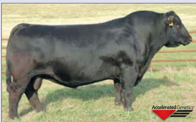
SAV PLATINUM 0010 - Reference Sire K.

A son of the Accelerated Genetics Pathfinder Sire SAV Platinum 0010 from a dam by SAV Resource 1441, backed by the Forever Lady family.