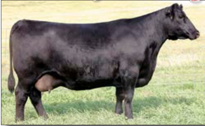
SAV EMBLYNETTE 7566 - Dam of Lots 4, 30-33, 42-48, and 165-167.