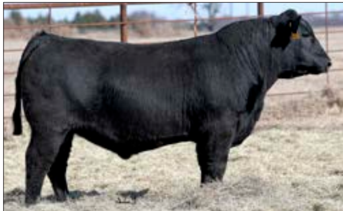
PENZ IGNITE 8560 - Lot 132

An impressive son of the proven sire SAV Instinct 4258 with an individual ribeye ratio of 107 and two maternal sisters in production who post a collective progeny weaning ratio of 103. The dam is backed by the Pathfinder Sires SAV Bismarck 5682 and SAV Net Worth 4200.