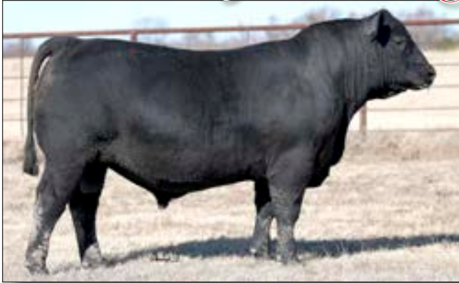
KLA ROCKET 9135 - Lot 38