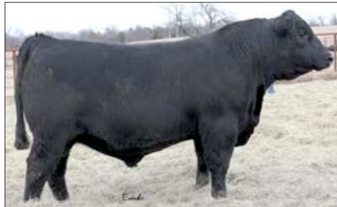
KLA GENERAL 949 - Lot 44