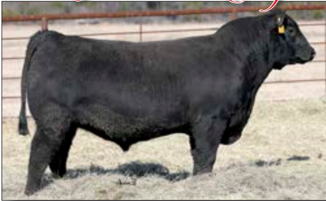
PENZ STUN GUN 8512 - Lot 57