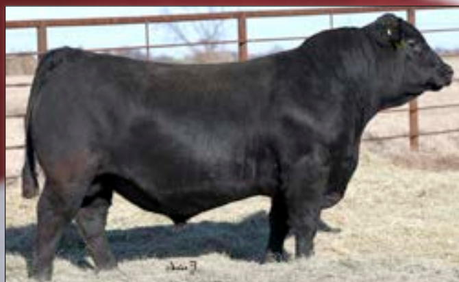
PENZ PREDECESSOR 8569 - Lot 106