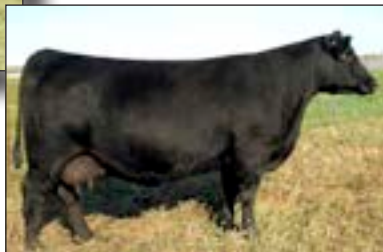
SAV QUEEN 4390 - Pathfinder Dam of SAV Caliber 6131.