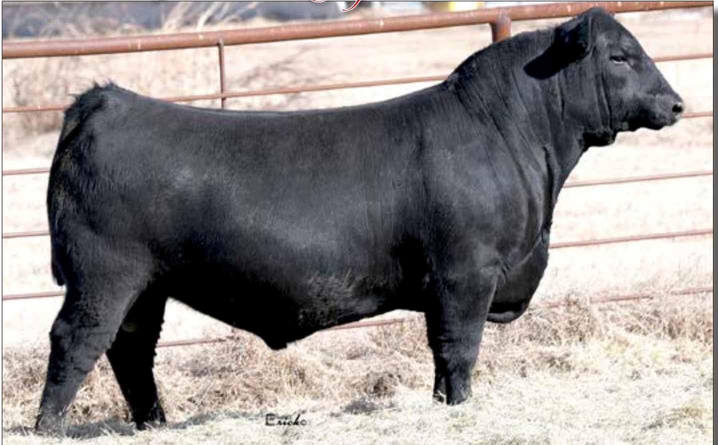
PENZ STUNNER 8502 - Lot 55