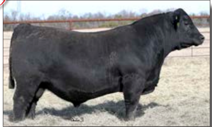
PENZ RECLAIM 8633 - Lot 147

A double-bred Rito bull with individual weaning and yearling ratios of 101 and 103, respectively. This bull is by the Penz featured sire SAV Rural Route 3302.