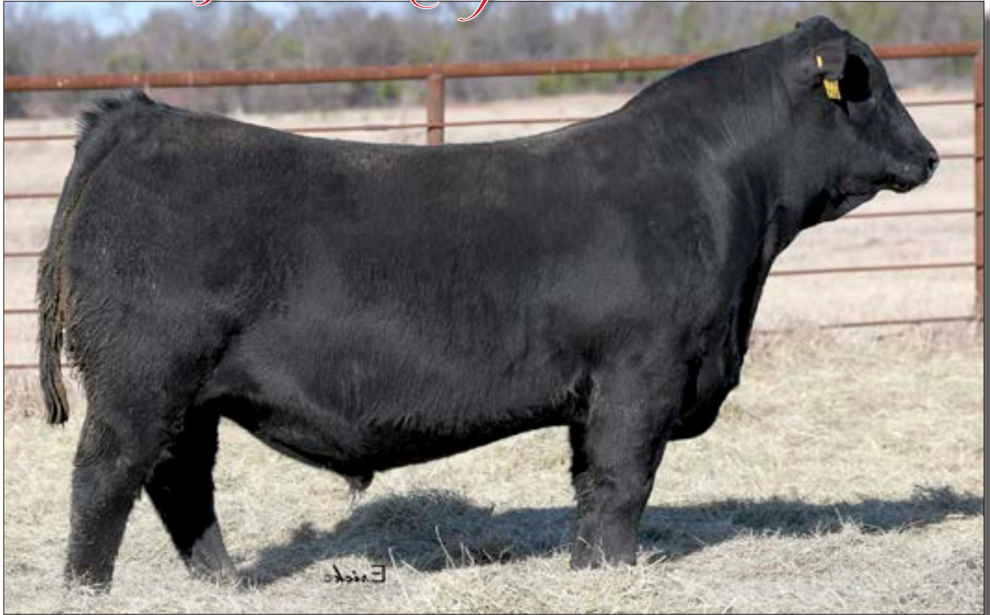
PENZ PRESIDENTIAL 8623 - Lot 3