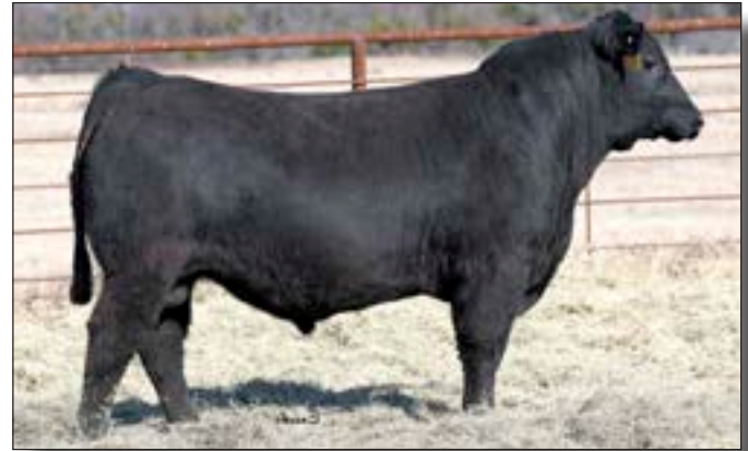
PENZ STUNNER 8523 - Lot 58

A member of the first calf crop by the featured sire SAV Caliber 6131. This bull has individual weaning and yearling ratios of 109 and 107, respectively from a second-generation Pathfinder Dam who records a progeny weaning ratio of 106 on seven calves and a progeny yearling ratio of 107 combined with progeny IMF and ribeye ratios of 102 and 103, respectively on six head.