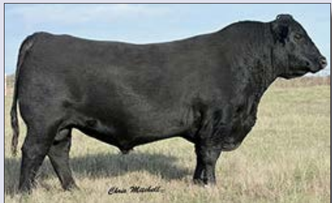
EXAR ENDURANCE 3949B - Reference Sire M.

The dam is by SAV Prospector 2439 while the grandam is by the Pathfinder Sire SAV Net Worth 4200.