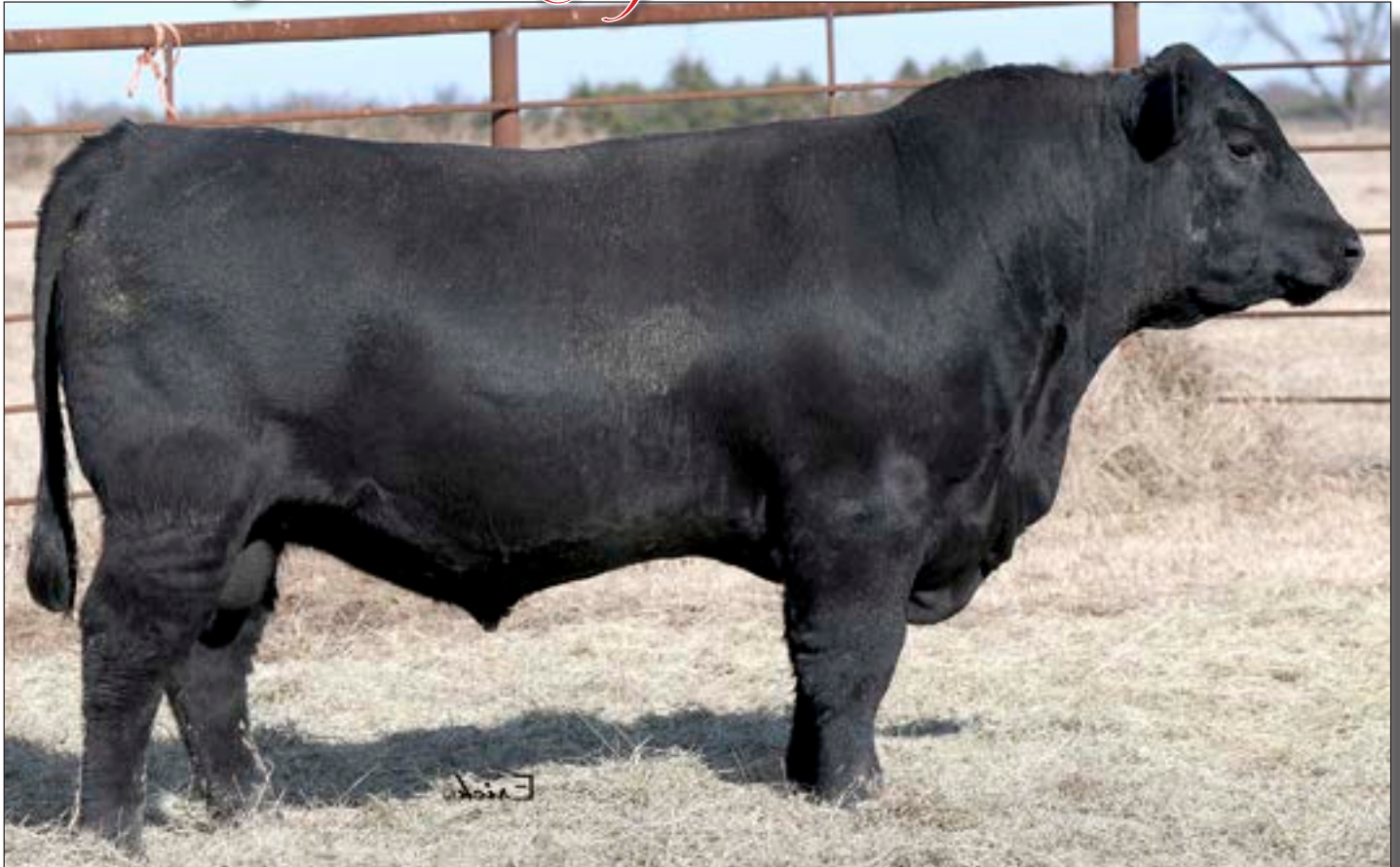
KLA BEST DECISION 944 - Lot 79