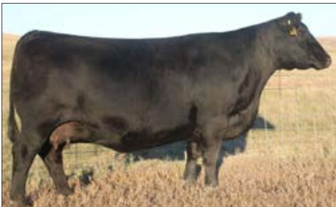
SAV EMBLYNETTE 2369 - This full sister to Lot 165 is a maternal sister to Lots 4, 30-33, 42-48, and 165-167.

This daughter of the $147,500 Accelerated Genetics Pathfinder Sire SAV 707 Rito 9969 is from the all-time top income-producing daughter of SAV Net Worth 4200, with more than $1.5 million in progeny sales-to-date.