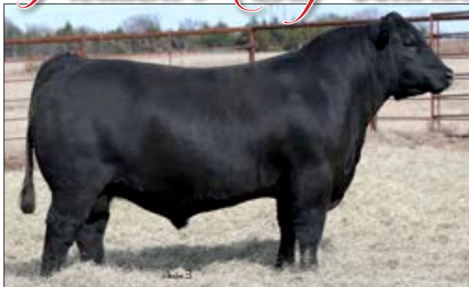
KLA CROWN PRINCE 9108 - Lot 51