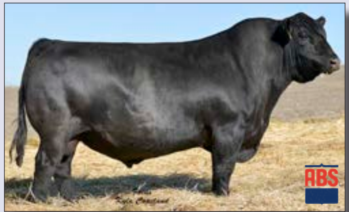
BASIN PAYWEIGHT 1682 - Sire of Reference Sire X.

This $20,000 third top-selling bull of the 2019 Coleman bull sale is a maternal brother to the $450,000 Coleman Bravo 6313 along with numerous other top-sellers.