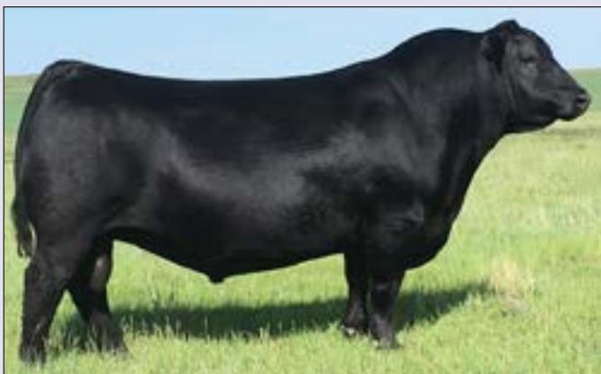
SAV PRESIDENT 6847 - Reference Sire A.

This powerful and popular performance bull transmits added muscle, dimension and structural soundness, backed by a proven heritage, from the world record-selling flush of bulls.