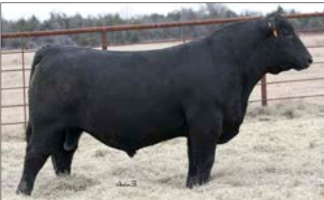
PENZ ROCK SHOW 8538 - Lot 31

Maternal sisters include the herd sire producers SAV Emblynette 0491 and SAV Emblynette 2369.