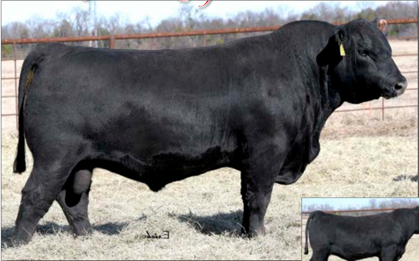
PENZ FOUNDATION 8653 - Lot 94