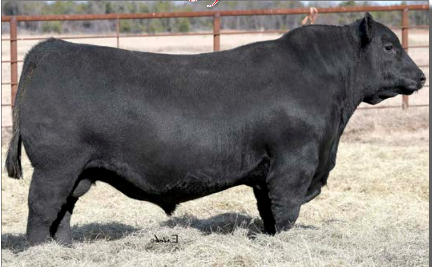
KLA READJUST 986 - Lot 26