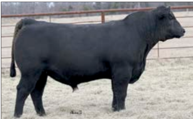
KLA JAKE 9130 - Lot 159

This bull has individual weaning and yearling ratios of 103 along with an individual ribeye ratio of 116 produced as the first calf from a two-year-old dam by SAV Regard 4863.