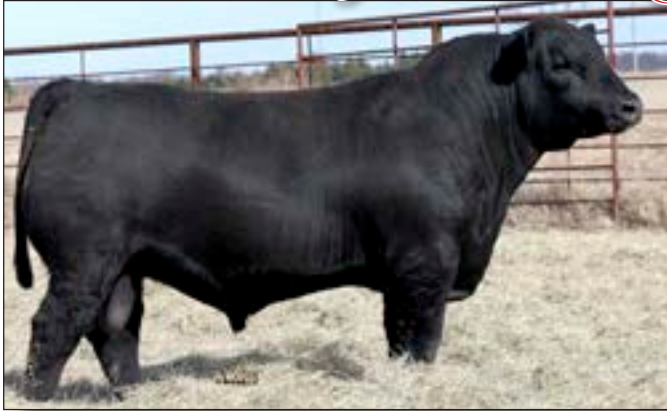
KLA 44 SPECIAL 927 - Lot 158