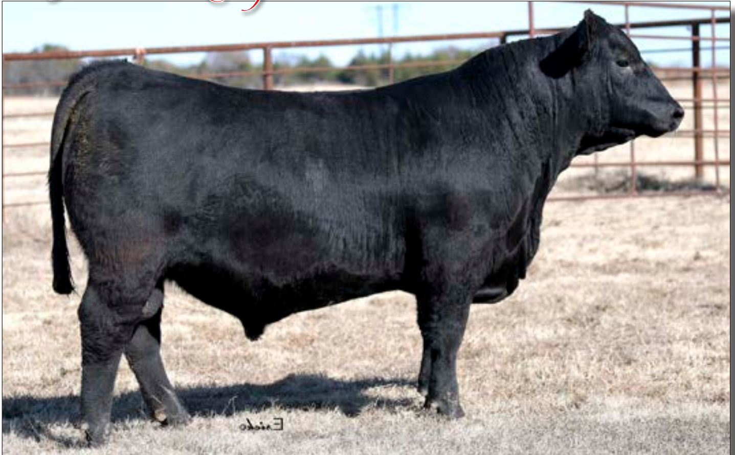
KLA PRESIDENTIAL 9134 - Lot 18