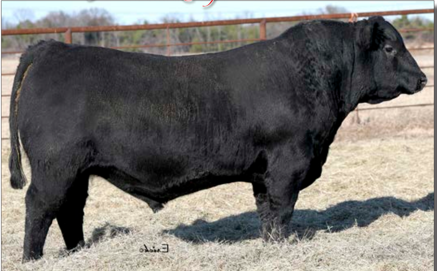
KLA PRESIDENT 9141 - Lot 5