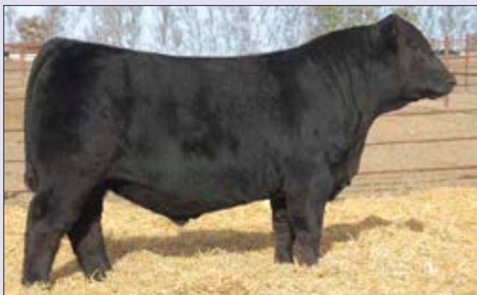
SAV OLD WEST 5147 - Reference Sire T.

The dam has a progeny birth ratio of 99 combined with a progeny weaning ratio of 107 on five calves and a progeny yearling ratio of 107 on four head while the grandam is a Pathfinder Dam.