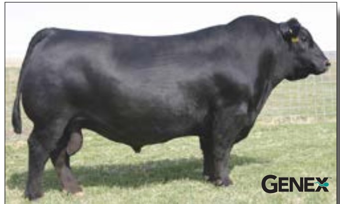
SAV NET WORTH 4200 - Sire of Lot 155.

A maternal sister records a progeny weaning ratio of 111 on her first two calves.