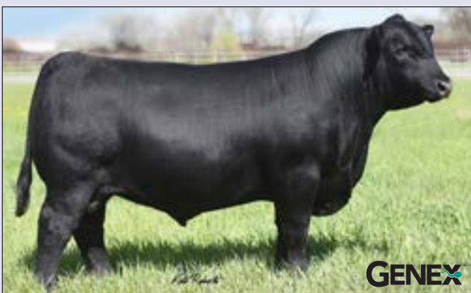
MUSGRAVE 316 STUNNER - Reference Sire H.

This bull combines an individual birth ratio of 81 with individual weaning and yearling ratios of 100 and 103, respectively along with an individual ribeye ratio of 109 as his dam's first calf in AHIR program.