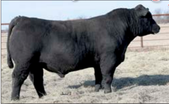
KLA GOLD CARD 97 - Lot 102