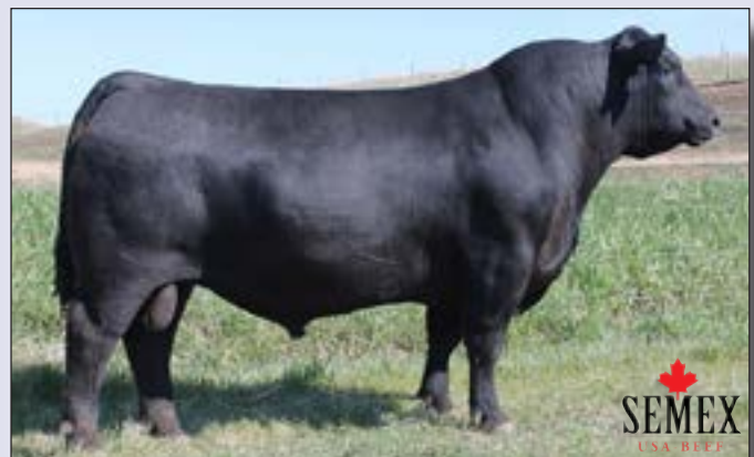
BUSHS EASY DECISION 98 - Reference Sire L.

This son of the Pathfinder Sire Vin-Mar O'Reilly Factor was produced from a Pathfinder Dam backed by multiple generations of Pathfinder Dams.