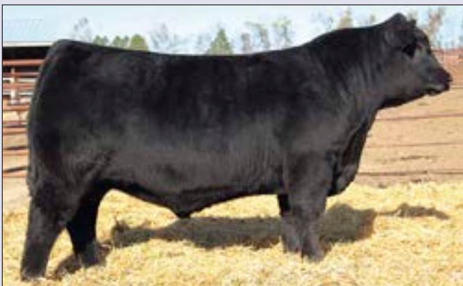
SAV IMPACT 5595 - Reference Sire V.

The dam of this bull has a progeny weaning ratio of 101 on ten calves along with a progeny IMF ratio of 109 on four head. Two maternal sisters post a collective progeny weaning ratio of 104.