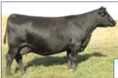
SAV QUEEN 0027 - Pathfinder grandam of SAV Caliber 6131.

This son of SAV Caliber 6131 records an individual weaning ratio of 107 as the first calf from a two-year-old dam by SAV Regard 4863. This bull traces twice to SAV Resource 1441.