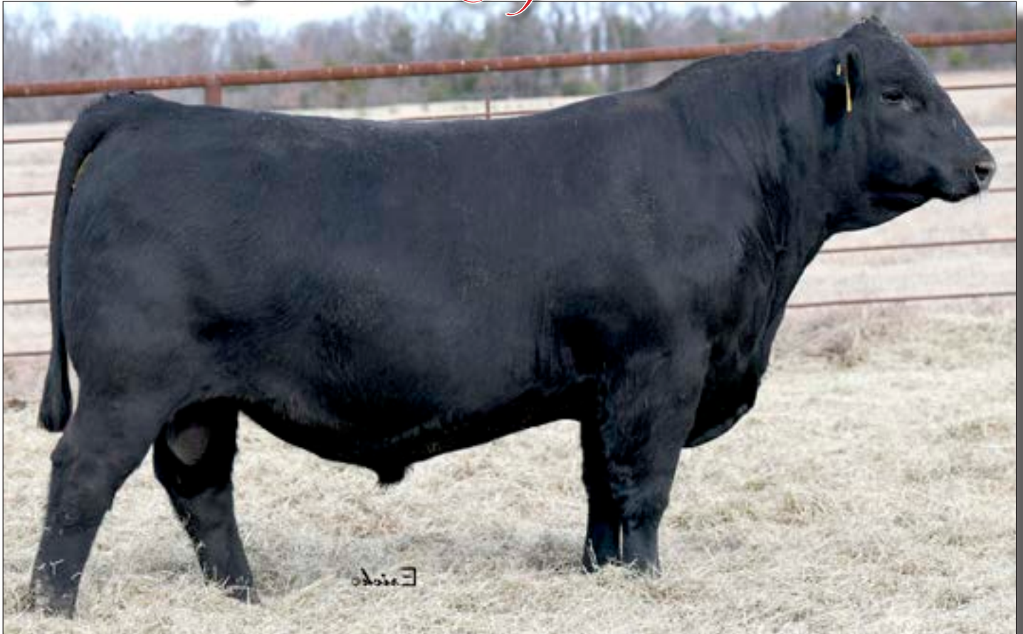
PENZ TEXBOOK 8500 - Lot 156