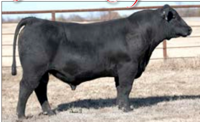
KLA EASY DECISION 912 - Lot 81