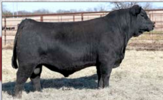
PENZ CAPTAIN 8513 - Lot 62