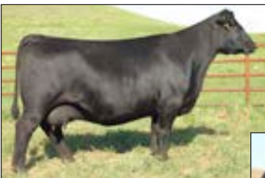
SAV EMBLYNETTE 0491 - Maternal sister to Lots 4, 30-33, 42-48 and 165-167.

This powerful herd sire prospect by the $750,000 one-time world record-selling SAV President 6847 is from a solid producing dam who is backed by the proven sires SAV Revere 1180 and SAV Net Worth 4200. The dam is a maternal sister to the $15,000 fourth top-selling bull of the 2019 President's Day Sale. This bull combines an individual birth ratio of 97 with individual weaning and yearling ratios of 104 and 109, respectively.