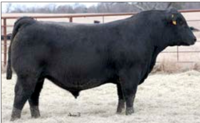
PENZ RURAL ROUTE 8657 - Lot 142

A low birth by SAV Instinct 4258 with an individual birth ratio of 93 combined with individual weaning and yearling ratios of 104 and 106, respectively. This bull is linebred to the Emblynette family from a dam with a progeny birth ratio of 99 combined with a progeny weaning ratio of 109 on eight calves and a progeny yearling ratio of 104 on seven head.