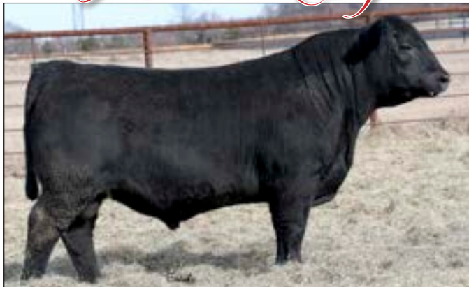
PENZ OUT WEST 8681 - Lot 117