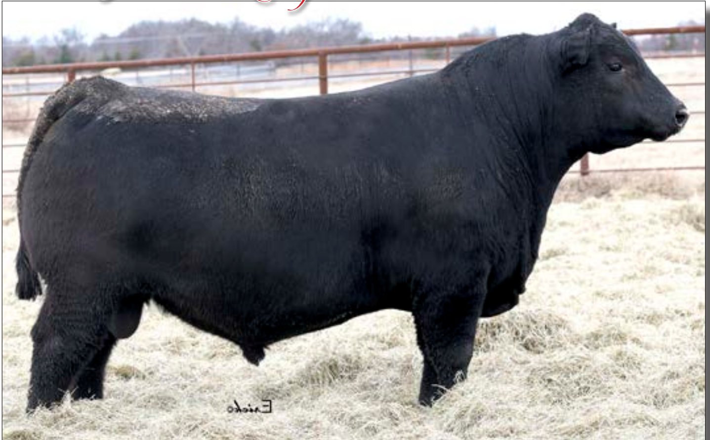
KLA CONCRETE PLUS 962 - Lot 49