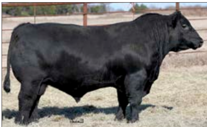
KLA CONFIDENCE PLUS 947 - Lot 52

This son of Connealy Confidence Plus has individual weaning and yearling ratios of 103 and 104, respectively along with individual IMF and ribeye ratios of 119 and 109, respectively as the first calf from a two-year-old dam by SAV Net Worth 4200. A flush brother to the dam of this bull was the $11,000 sixth top-selling Lot 1 bull of the 2018 President's Day Sale while a maternal brother to the dam of this bull was the $19,000 top-seller of the 2013 President's Day Sale.