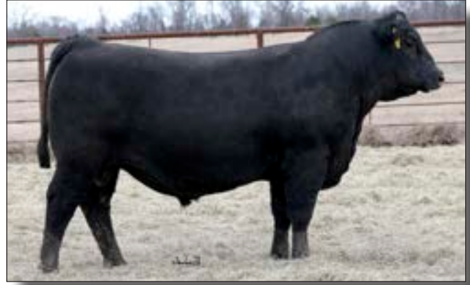
PENZ E-COMMERCE 8580 - Lot 90

This Albrecht/Penz and Freeny sire is from the famous herd sire producing Forever Lady family tracing to the All-American Grand Champion Cow SVF Forever Lady 57D.