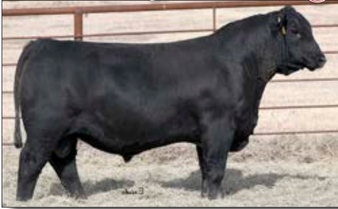
PENZ RESOURCE 8624 - Lot 34